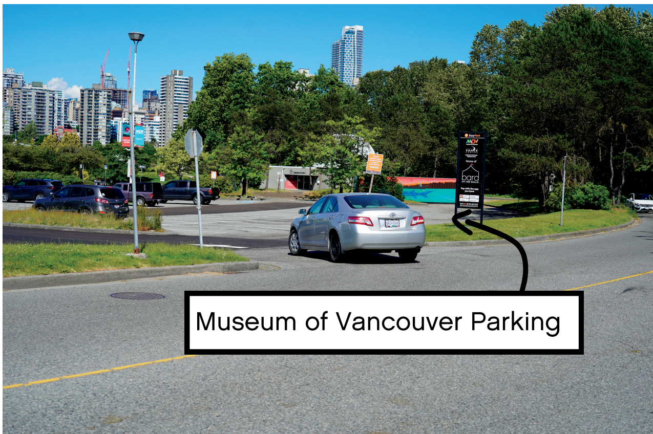
Museum of Vancouver Parking

The address for the parking lot is 1100 Chestnut St, Vancouver, BC. If you see the Bard on the Beach logo on the sign at the entrance, you're at the right place!